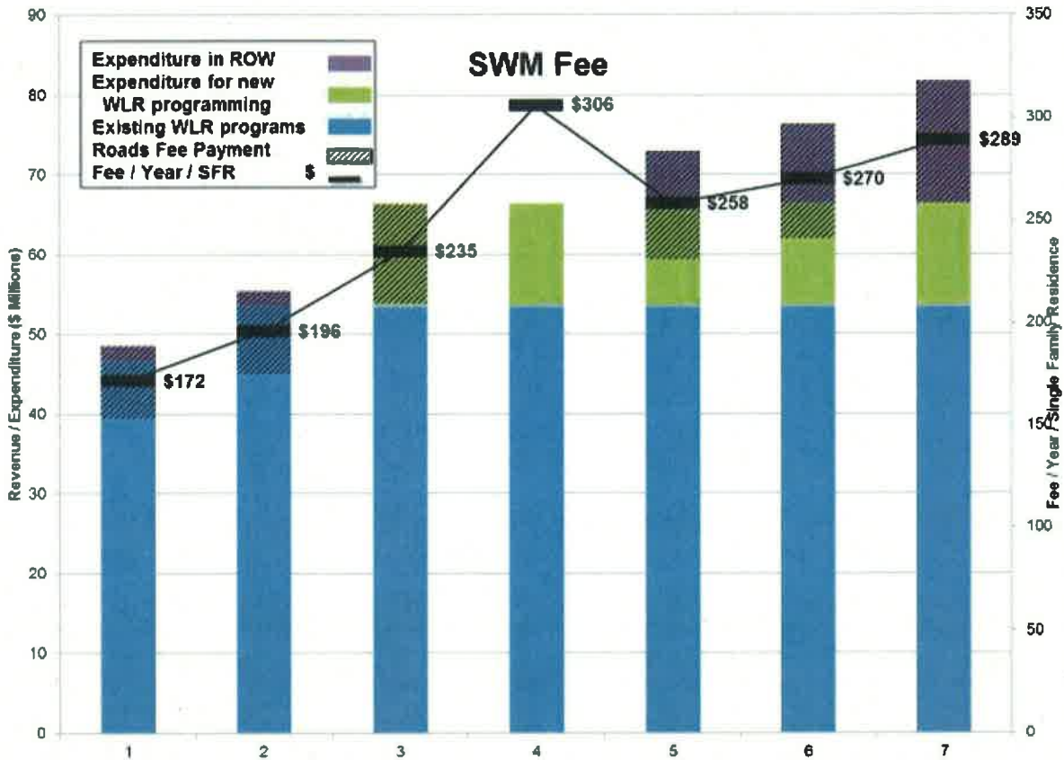
Figure 1: SWM Fee Scenarios

The SWM fee rate will be set to fund programmed expenditures. Decisions about what services will be funded out of the next SWM rate will be determined during the 2017/2018 budget process. To prepare for these decisions, Figure 2 shows a forecast of Scenario 6 to demonstrate how different expenditure packages could affect the rate over time. As with Figure 1, in Figure 2 all of the colored bars align with the left vertical axis that indicates the amount of revenue needed to support the scenario's program expenditures. The first set of expenditures (blue) represent existing programming funded by SWM fee revenues that is adjusted for inflation. Layered on top of the existing programming is the carryover of appropriation for drainage projects in the ROW from the 2015/2016 budget (red). The next layer (green) represents the funding for the expansion of programs for WLR drainage assets and water quality improvement programs. The last layer (purple) represents funding for additional drainage work in the road right of way. These cost packages illustrate what could be included in a SWM rate.